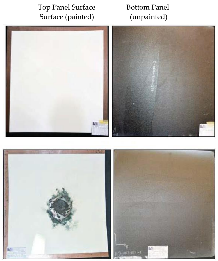
Figure 8 – Panel 032-1 No through hole penetration, Copper side against tool.