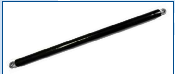
Park's ALPHA STRUT™