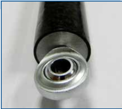
Example of a rod end incorporated into Park's ALPHA STRUT™

ALPHA STRUT™ is Park Aerospace Corp.'s proprietary composite strut. The ALPHA STRUT design combines light-weight composite materials with Park's proprietary end-fitting which is co-cured into each end of the strut without the use of adhesives. This creates an axial load carrying component which is suitable for a variety of aircraft and other aerospace high to medium load bearing applications. The ALPHA STRUT design provides significant weight savings compared to metal struts and other composite struts.